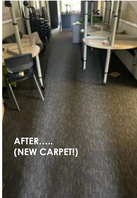
AFTER..... (NEW CARPET!)